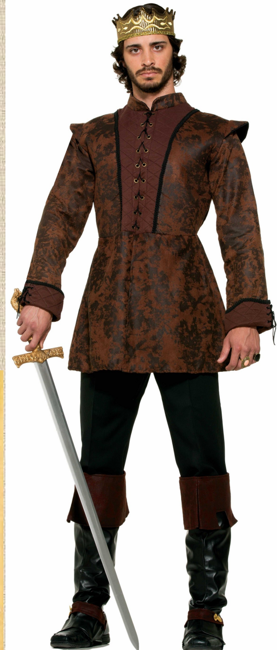
The kings and queens were royalty.