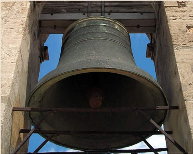
The bell-ringers ring the bells.