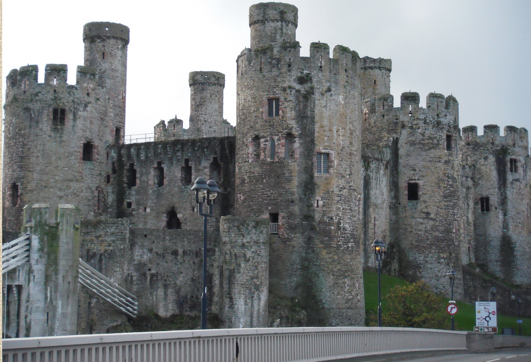
Conwy Castle, Wales 14th Century