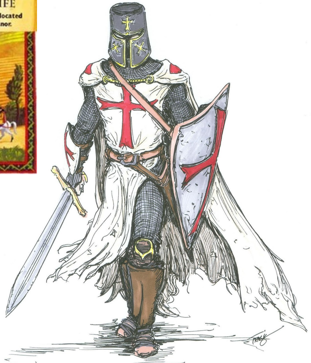
The folk they lived by the castle gate protected by the knight